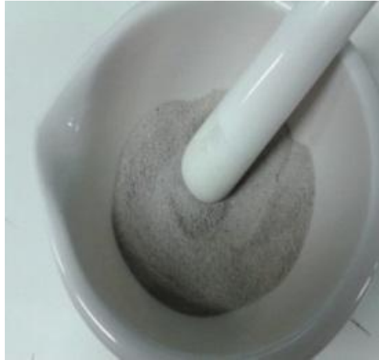
Fig. 2. Dehydrated silicon powder

Table 3 shows the mixture proportions of clay and silicon powder for the production of 18 rectangular testpieces in a scale from 0 to 100% of clay and silicon that were produced in a hydraulic press Shimadzu model and 120 kN capacity. The samples were pressed at 40 kN with the following dimensions described in Table 4 and noted in Figure 3.