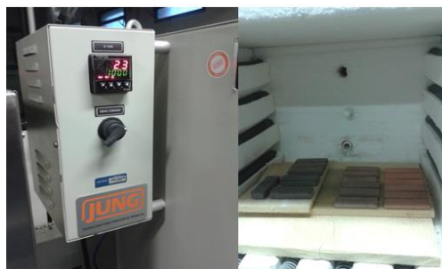
Fig. 4. Test piece burn

The test specimens were wrapped in an oven as a muffle furnace for 24 hours at an increasing temperature from 0 to 1000 °C with one hour rest after the burn was complete, as it's shown in Figure 4. According to the Brazilian Ceramic Association, after drying, the pieces must undergo a thermal treatment at high temperatures and for most of the products, the temperature is between 800 °C to 1700 °C, in continuous or intermittent ovens.