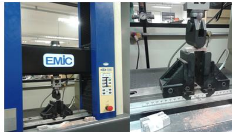
Fig. 6. Bending test in test specimen