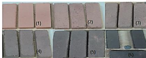
Fig. 3. Test specimen after pressing

The test specimens were wrapped in an oven as a muffle furnace for 24 hours at an increasing temperature from 0 to 1000 °C with one hour rest after the burn was complete, as it's shown in Figure 4. According to the Brazilian Ceramic Association, after drying, the pieces must undergo a thermal treatment at high temperatures and for most of the products, the temperature is between 800 °C to 1700 °C, in continuous or intermittent ovens.