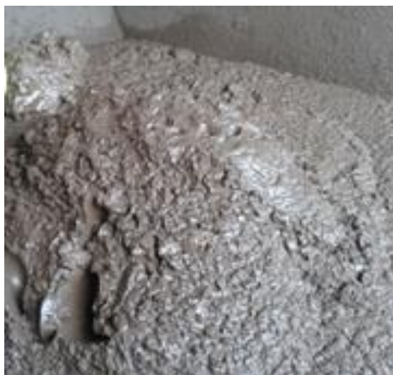
Fig. 1. Silicon industrial waste sludge

For the production of the test specimen, there were 2.5 kilograms of silicon industrial waste sludge in the Digital Timer microprocessor oven Sterilifer at 90 °C for 48 hours for dehydration. After drying, there was a gain of 0.250 kilograms that were ground until obtaining a very fine aggregate as it's shown in Figure 2.